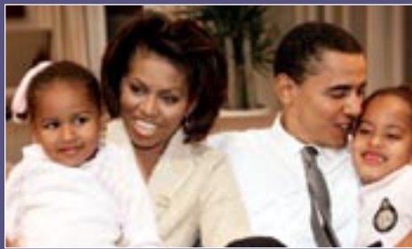
Barack Obama and family