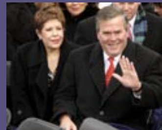
Jeb and Columba Bush

Bigotry disguised as religious truth also is used by those who oppose full and equal rights for gay, lesbian, bisexual and transgender people.